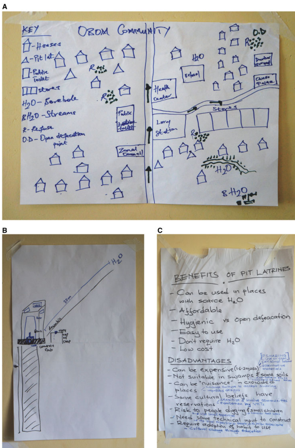
Fig. 1: Examples of feature mapping (A), participatory drawing (B) and conclusions from round-table discussions about pit latrines (C). The map was drawn by a Ugandan CHW, demonstrating some of the key water and sanitation facilities in their local area. The participatory drawing was created by a Ghanaian CHW and describes some of the key features of pit latrine construction. Original drawings in (A) and (B) used black pen and altered using blue pen during group discussions. These discussions resulted in the advantages and disadvantages that are seen in (C) and summarized in Table 1.