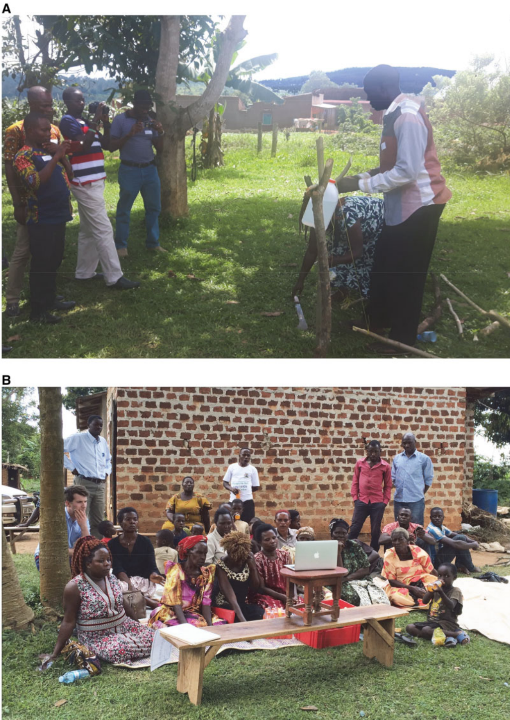
Fig. 2: Two Ugandan CHWs demonstrating how to construct a low-cost tippy-tap for hand washing (A). In the background Ugandan and Ghanaian CHWs can be seen videoing the demonstration. In (B) villagers watch the workshop video (05:39 min; Elimu Health 2018 ).